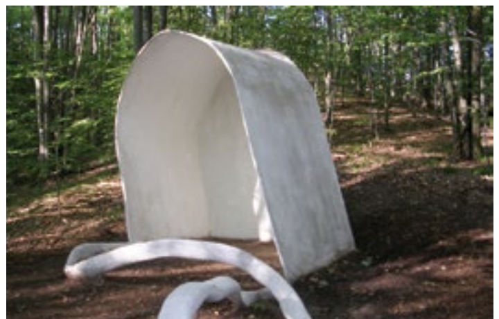
Bonnet (Detail) by Lois Teicher

Work with the teacher to illustrate a poster size version of the poem.