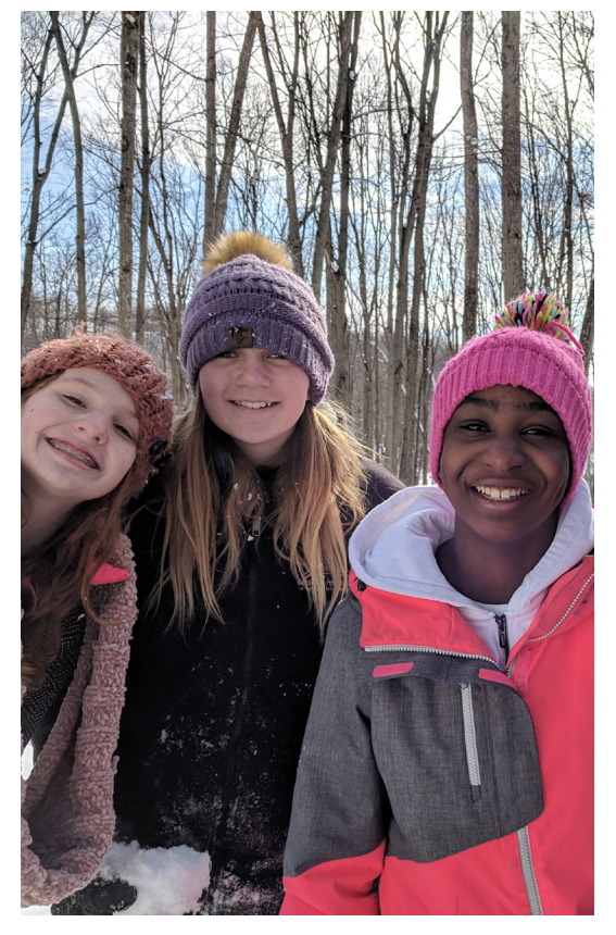
2019 • MICHLEGACYARTPARK.ORG 11