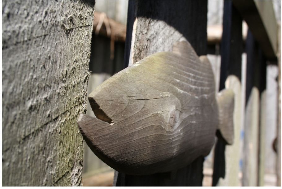
"WITHOUT A SENSE OF HISTORY, PEOPLE ARE LOST IN TIME AND IN LOCATING THEMSELVES IN THE WORLD."